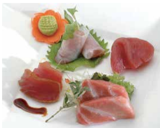
鯖三昧 Maguro zanmai 380