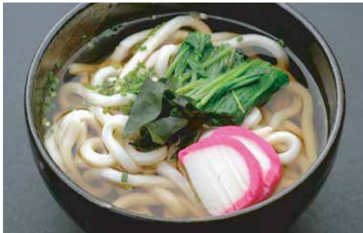
若芽うどん/そば Wakame udon / soba 70/85