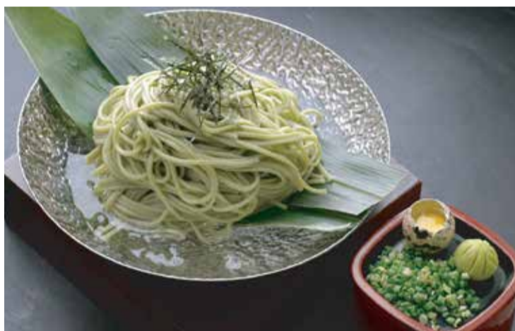
茶そば Cha soba 80