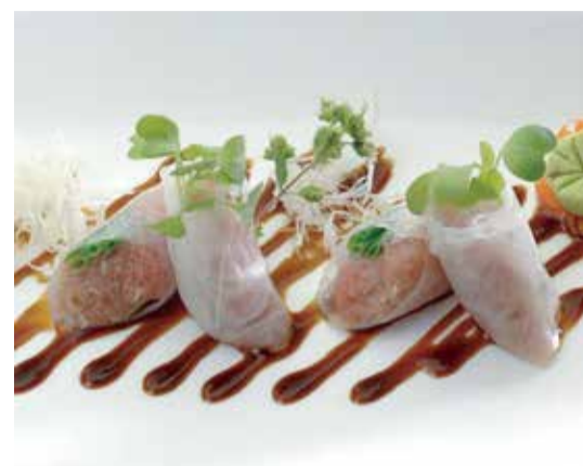
ネギトロ生春巻き Negitoro nama harumaki 210