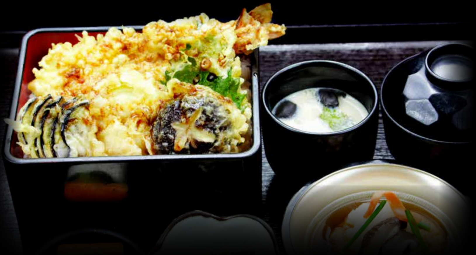
Ten Jyu Set 天重御膳