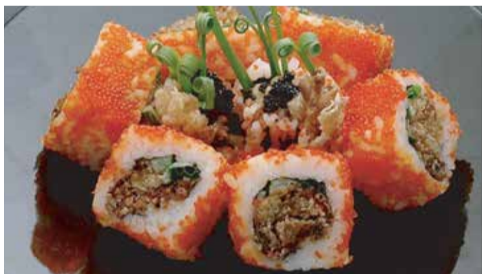
スパイダー Spider Roll

salmon flakes, avocado, tobiko and scallop