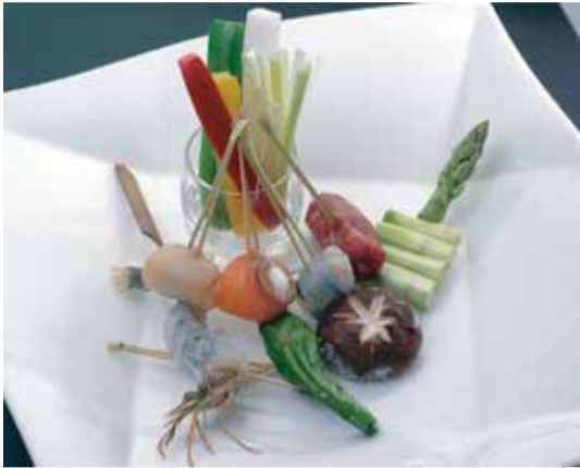
串揚げ盛り Kushiage mori 100 Assorted deep fried skewers