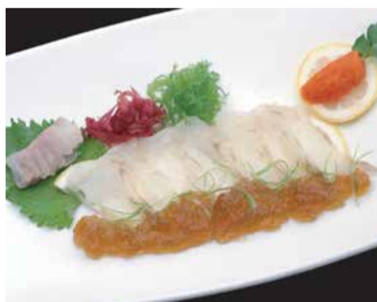
平目薄造り Hirame usuzukuri 320

Marinated sliced raw Tuna topped with Yam