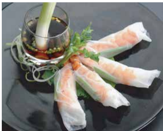
海老餃子 Ebi gyoza 85

Grilled salmon with Salt / Teriyaki sauce