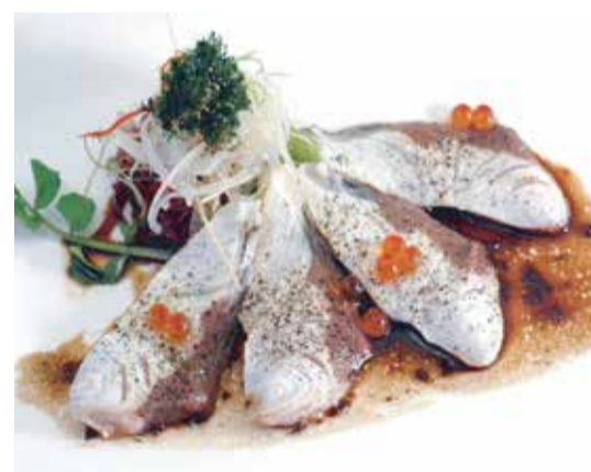
炙りカンパチ<バルサミコ風味> Aburi kanpachi 265

Thin sliced Flounder sashimi served with Ponzu-jel