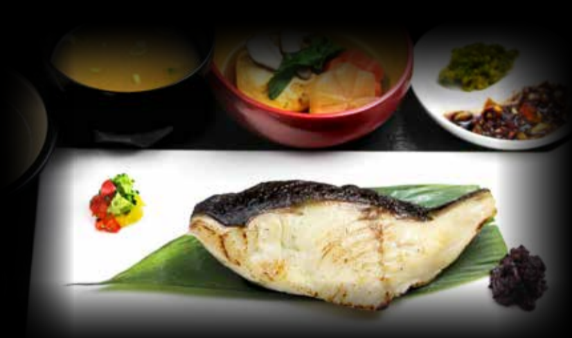
Gindara Saikyou Yaki Set 280++

small sashimi, miso soup, pickles, chawanmushi, kobachi, otoshi & dessert