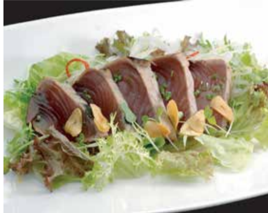
鰹たたきサラダ Katsuo tataki salad 150

Salmon belly sashimi served with orange sauce