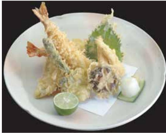
天麩羅盛り Tempura mori 100 Assorted Tempura