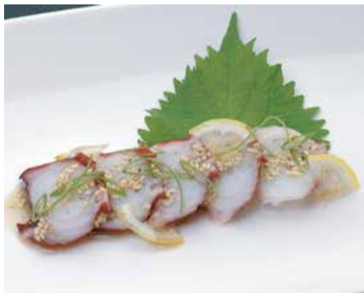
たこ胡麻塩和え Tako goma shio ae 85