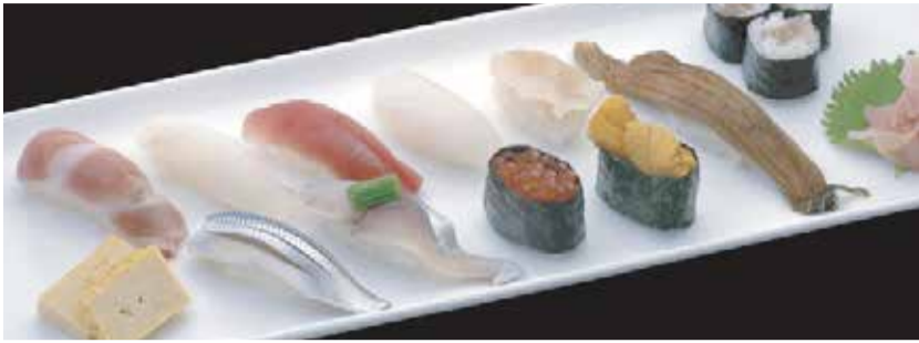
おまかせ握り又は、ちらし Omakase nigiri / chirashi 490

Chef's recommended Nigiri-sushi or Chirashi-sushi