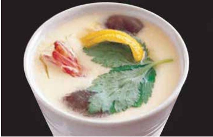
海鮮茶碗蒸し Kaisen chawn-mushi 70

Savory steamed egg custard with assorted ingredients