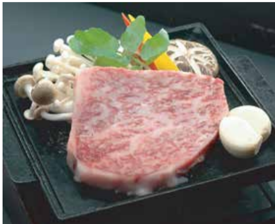
黒毛和牛石焼き 200g/portion- Kuroge Wagyu ishiyaki 1500

Japanese Kuroge Wagyu beef cooked with stone plate