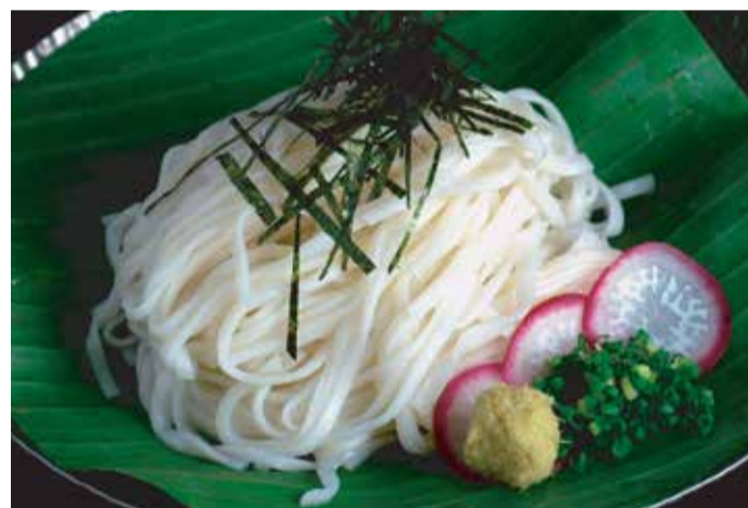
稲庭うどん Inaniwa udon 90