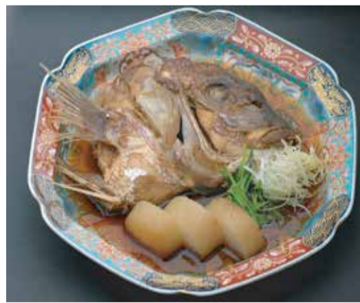
鯛兜煮 Tai kabutoni 250

Boiled head of Red bream fish with sweet soy sauce