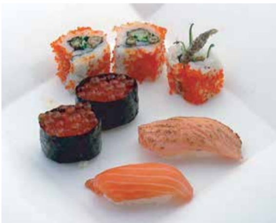
サーモン尽くし Salmon zukushi 200

Toro, Sea urchin and Salmon roe on sushi rice