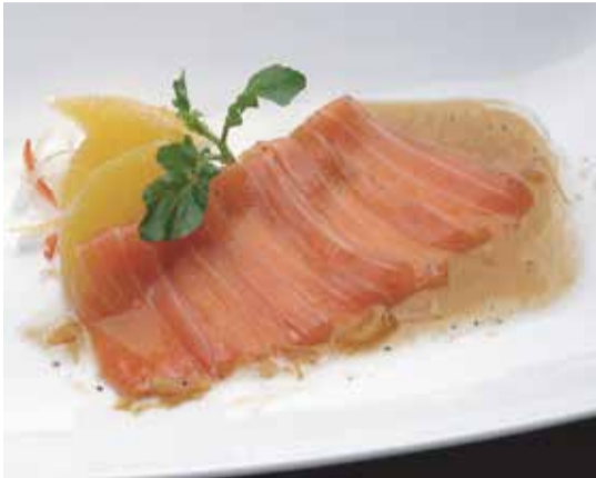
とろサーモンのカルパッチョ Toro salmon carpaccio 180

Salmon belly sashimi served with orange sauce