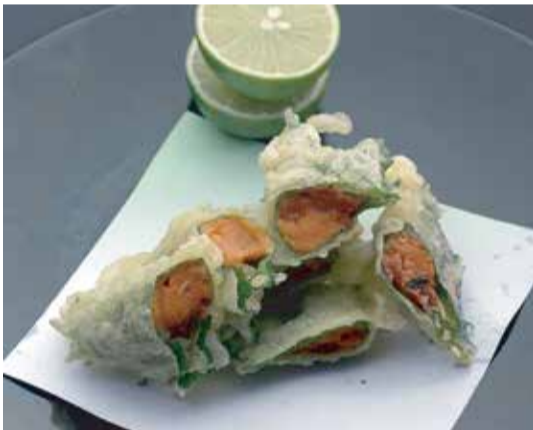
ウニ天 Uni ten 100 Sea urchin with Shiso leaf Tempura