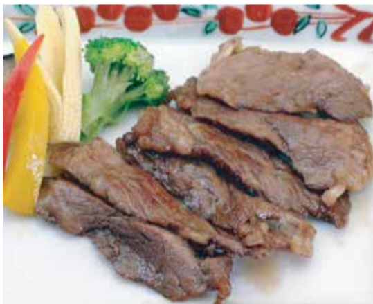
ビーフ照り焼き Beef teriyaki 125

Grilled Scallop and vegetable with mild spicy sauce in a shell