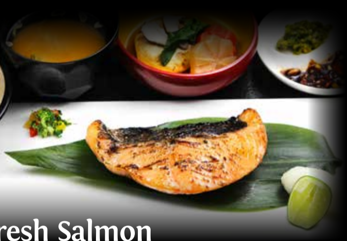
Fresh Salmon Teriyaki /Shioyaki Set 180++

サーモンハラス炭火焼き御膳 Grilled salmon belly small salmon sashimi, miso soup, pickles chawanmushi, kobachi, otoshi & dessert