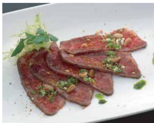
和牛たたき風 Wagyu tataki fu 320