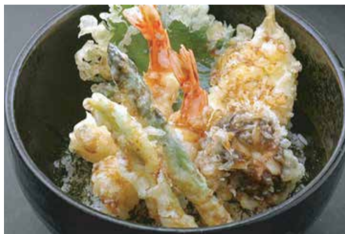
天井 Ten don 90

Grilled Australian Wagyu beef on rice bowl