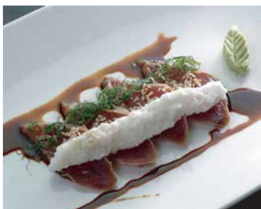
天然鯖のツケ Tennen maguro zuke 180

Marinated sliced raw Tuna topped with Yam