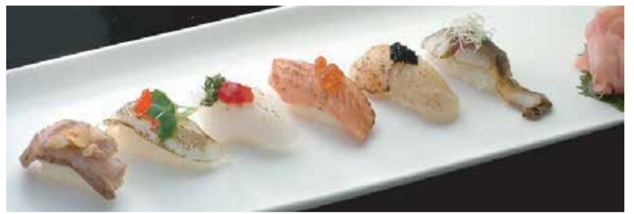
炙り盛り Aburi mori 350

Chef's recommended Nigiri-sushi or Chirashi-sushi