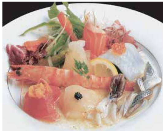
シーフードマリネ Seafood marine 230

Assorted raw seafood with vegetable served with our special dressing