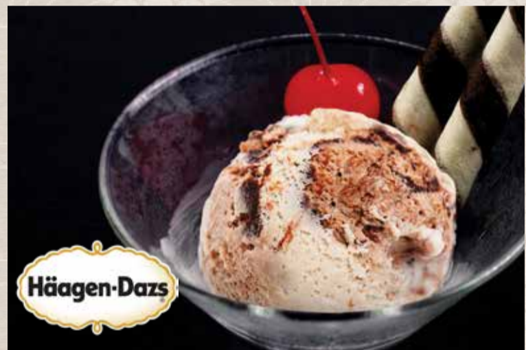
Tiramisu Ice Cream