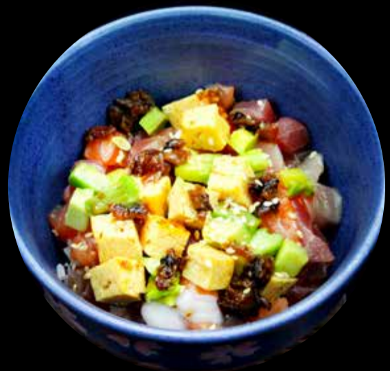
小バラちらし丼 Small Barachirashi Don