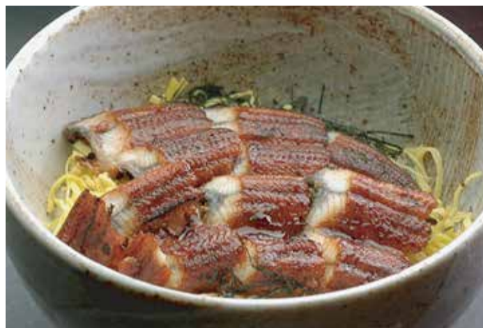
うなぎ井 Unagi don 300