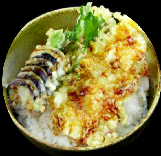
小天丼 Small Ten Don