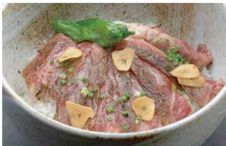
和牛網焼き井 Wagyu amiyaki don 420

Grilled Australian Wagyu beef on rice bowl