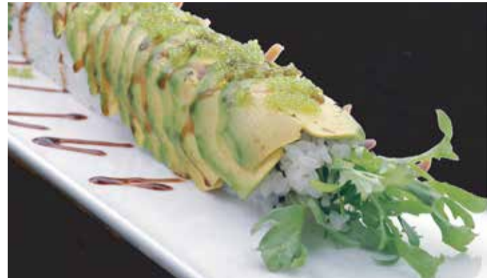
キャタピラー Caterpillar Roll

eel, spring onion, lettuce and beef flake