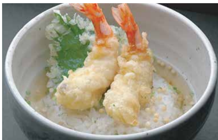
天茶 Ten cha 70