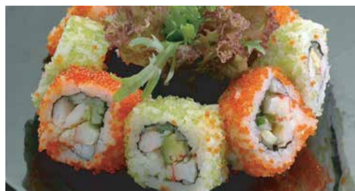
カリフォルニア California Roll

soft shell crab, spring onion, tobiko and lettuce