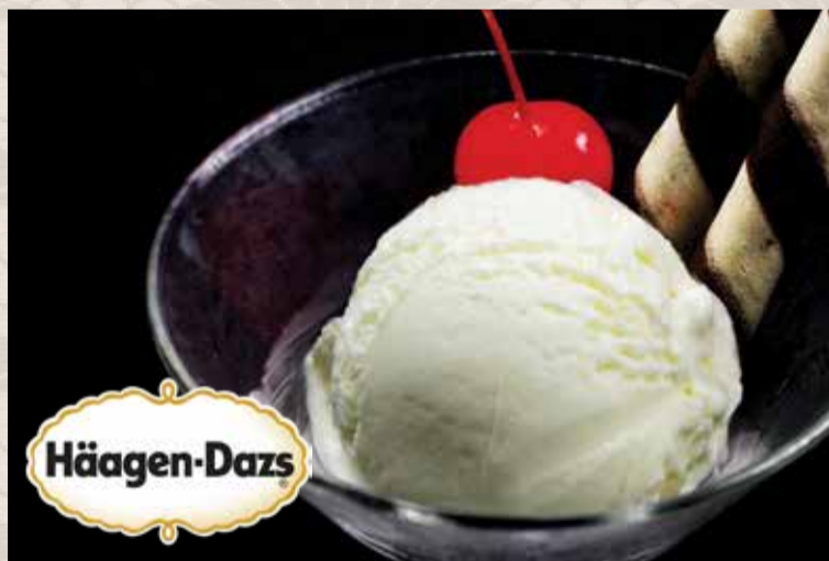
Vanilla Ice Cream