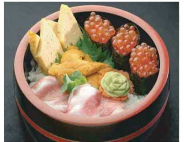
三色丼 Sanshoku don 470

Salmon sashimi and Salmon roe on sushi rice