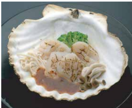
帆立貝ピリ辛焼き Hotate pirikara yaki 130

Grilled silver cod with Salt / Teriyaki sauce