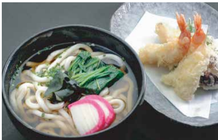
天麩羅うどん/そば Tempura udon / soba 85/95