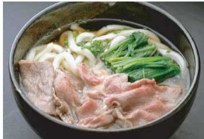
肉うどん/そば Niku udon / soba 85/100