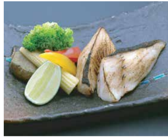
ギンダラ焼き <塩・照り焼き> Gindara yaki 165

Sauteed Australian Wagyu Beef served with assorted mushroom