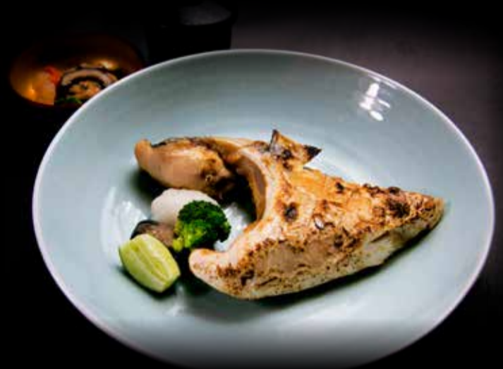
Hamachi Kama Shioyaki Set

Grilled premium gindara with saikyo miso small sashimi, miso soup, pickles, chawanmushi kobachi, otoshi & dessert