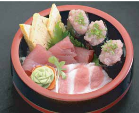
鮪丼 Maguro don 320