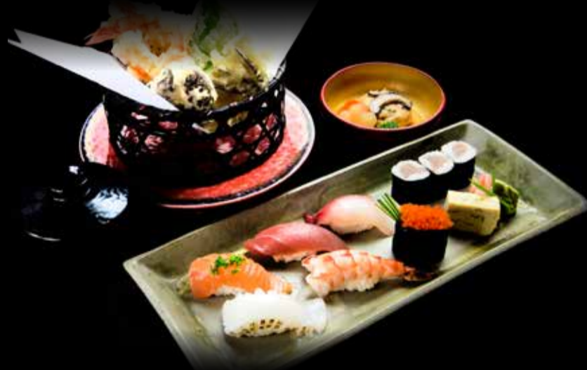
Tenpura & Sushi Set 230++

miso soup, pickles, chawanmushi nimono, kobachi, otoshi & dessert