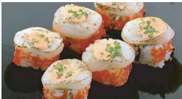
ベイ アイランド Bay Island Roll

crab meat, avocado, cream cheese, tobiko and lettuce