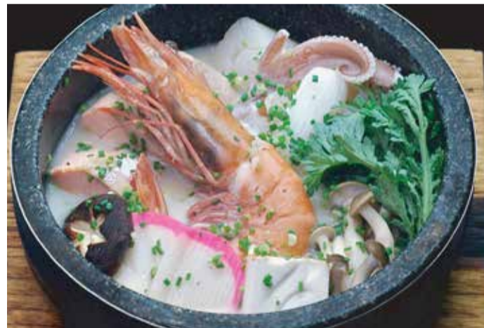
石焼海鮮豆乳うどん Ishiyaki kaisen tounyu udon 120

Udon noodles with seafood in soy milk soup