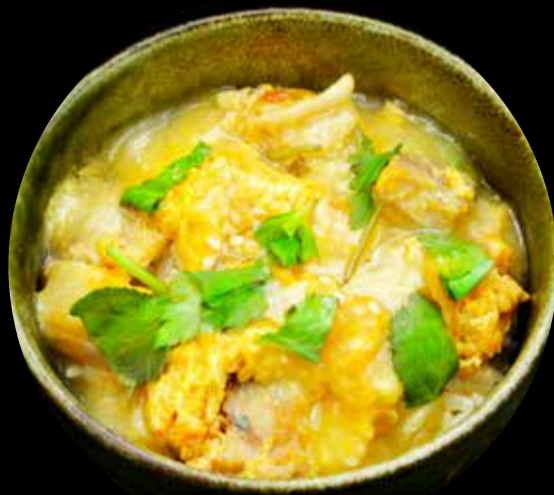
小親子丼 Small Oyako Don