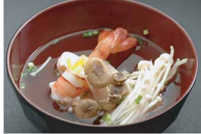
お吸い物 Osuimono 55