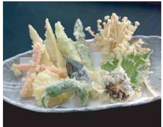
野菜天 Yasai ten 80 Vegetable Tempura