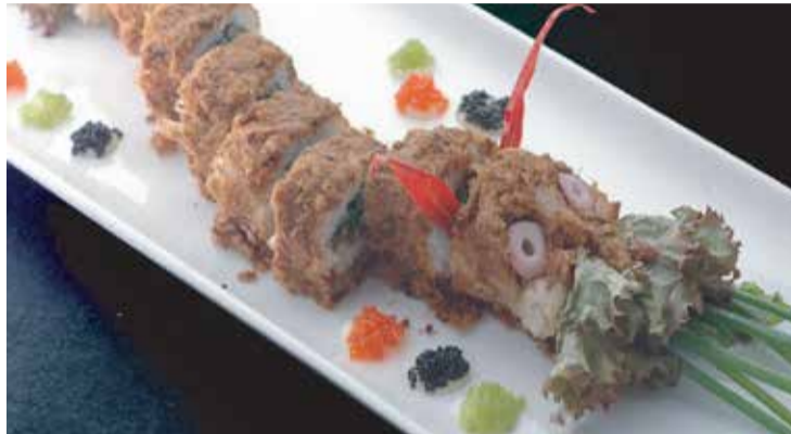
ドラゴン Dragon Roll