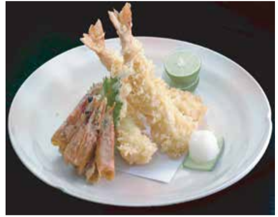
海老天 Ebi ten 120 King Prawn Tempura