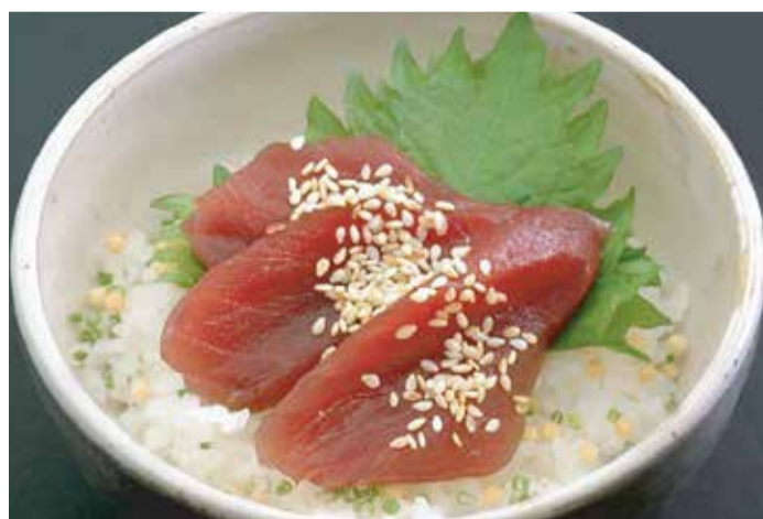
鮪のツケ茶 Maguro zuke cha 90

Rice soup topped with marinated raw tuna