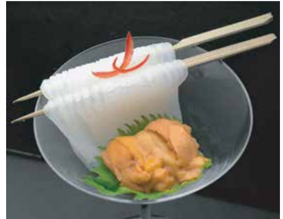
いか海胆そうめん Ika uni soumen

Thinly sliced squid sashimi and sea urchin