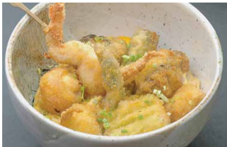
串揚げ玉とじ井 Kushiage tamatoji don 90