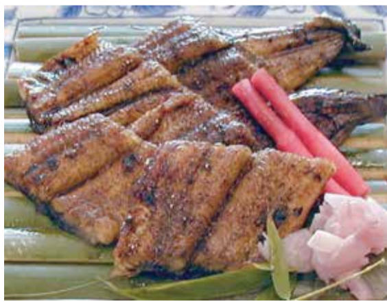
うなぎ蒲焼 Unagi kaba yaki 300

Dumpling with king prawns and vegetable stuffing