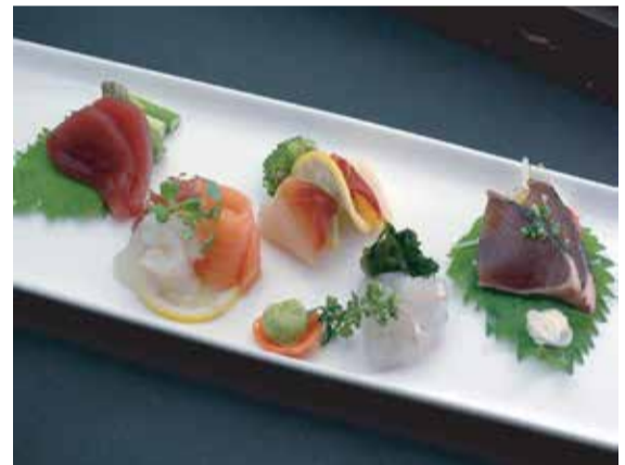
刺身盛り Sashimi mori 450

Assorted raw seafood with vegetable served with our special dressing