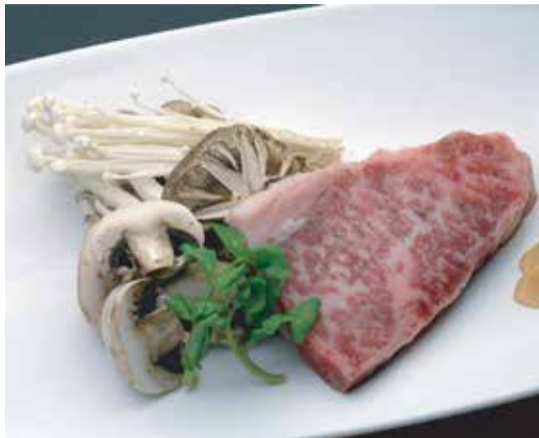
オーストラリア和牛 キノコ添え -120g/portion- Wagyu kinoko soe 500

Sauteed Australian Wagyu Beef served with assorted mushroom