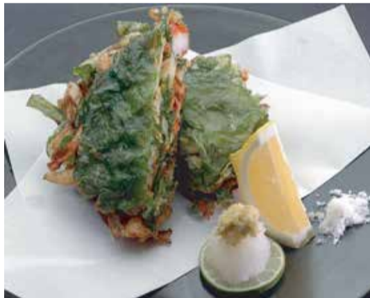
特製かき揚げ Tokusei kaki age 90 Mixed seafood with cut vegetable Tempura