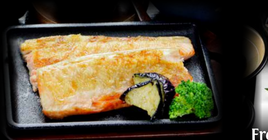
Fresh Salmon Harasu Sumibiyaki Set 220++

Bowl of rice topped with marinated fresh salmon miso soup, pickles, chawanmushi, nimono, kobachi, otoshi & dessert