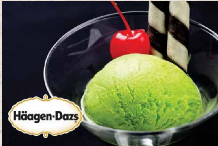
Matcha Ice Cream