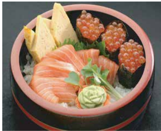
海鮮親子丼 Kaisen oyako don 265

Salmon sashimi and Salmon roe on sushi rice