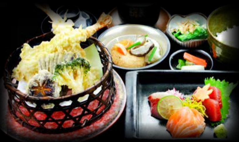
Tenpura & Sashimi Set 230++

Box of rice topped with tempura miso soup, pickles, chawanmushi, nimono, kobachi, otoshi & dessert