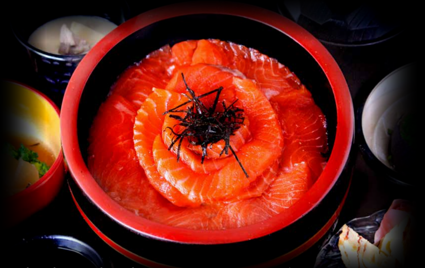
Fresh Salmon Chirashi Set サーモンちらし御膳