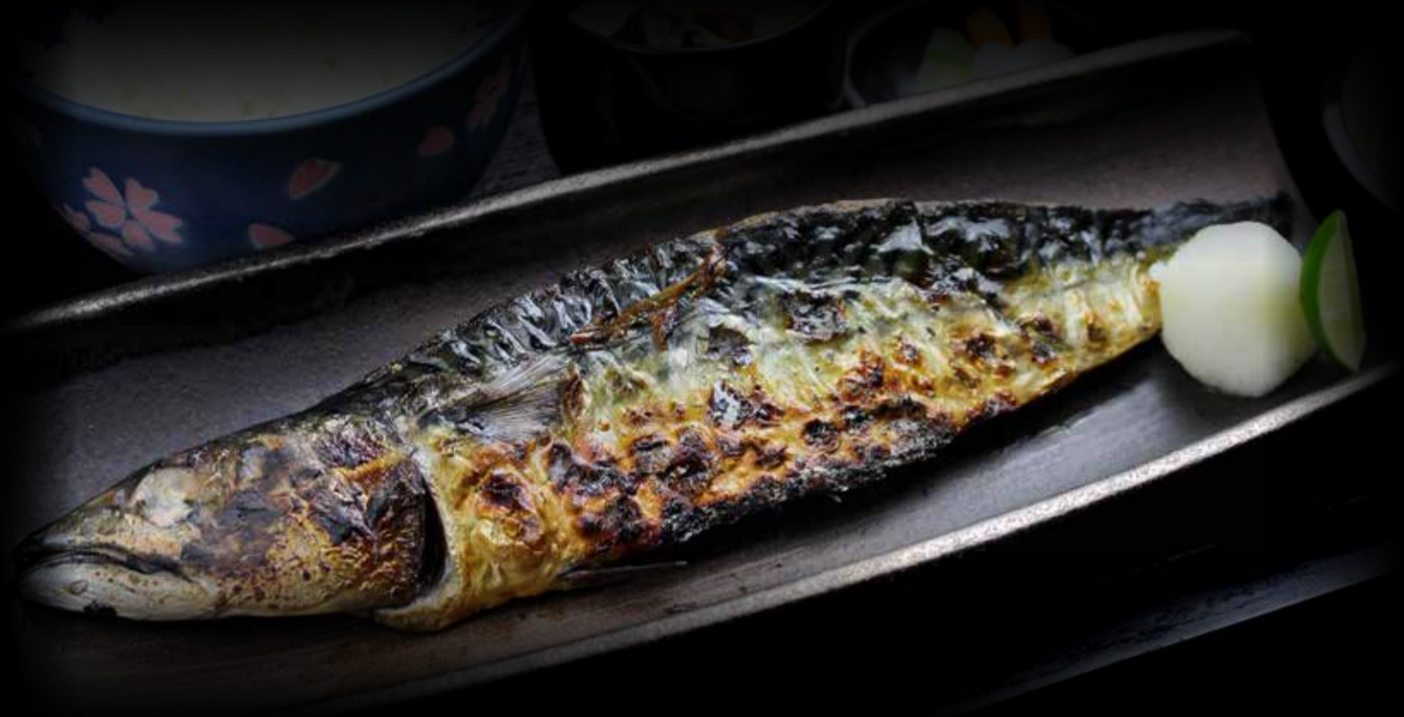
Jikasei Haiboshisaba Set 自家製 灰干し鯖御膳