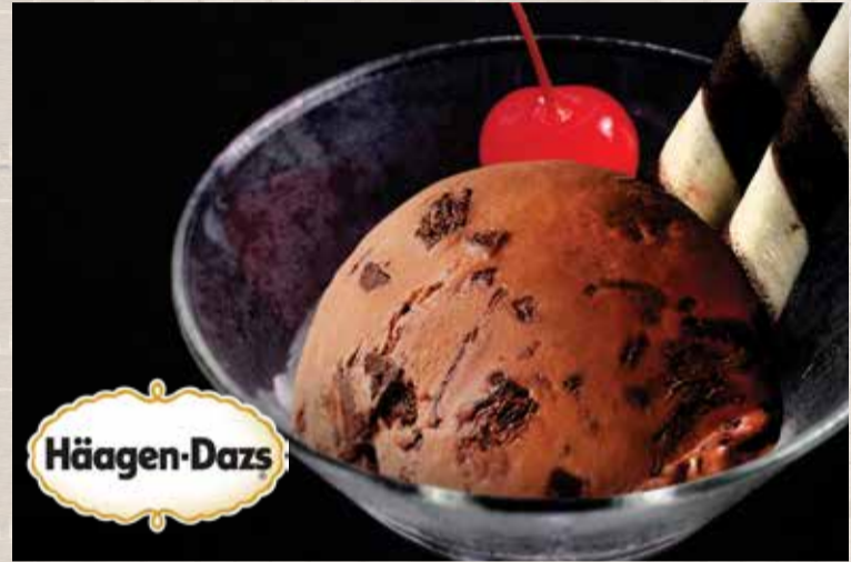
Chocolate Ice Cream