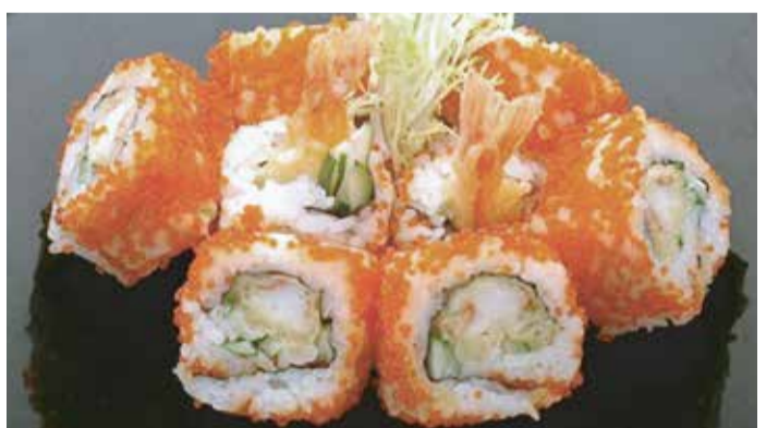
天麩羅 Tempura Roll

crab meat, prawns, avocado, tobiko and lettuce