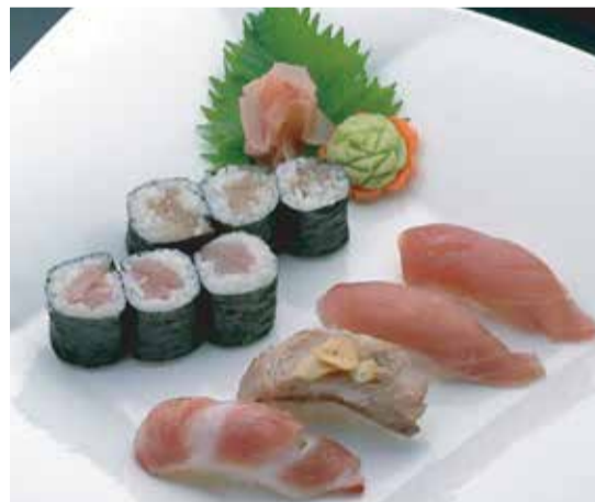
鮪尽くし Maguro zukushi 350