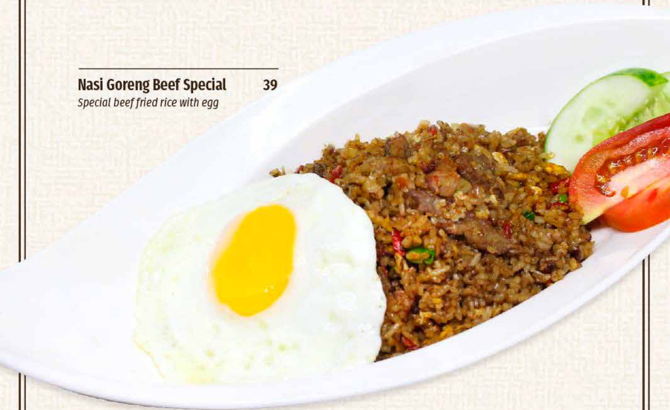
Nasi Goreng Beef Special 39 Special beef fried rice with egg