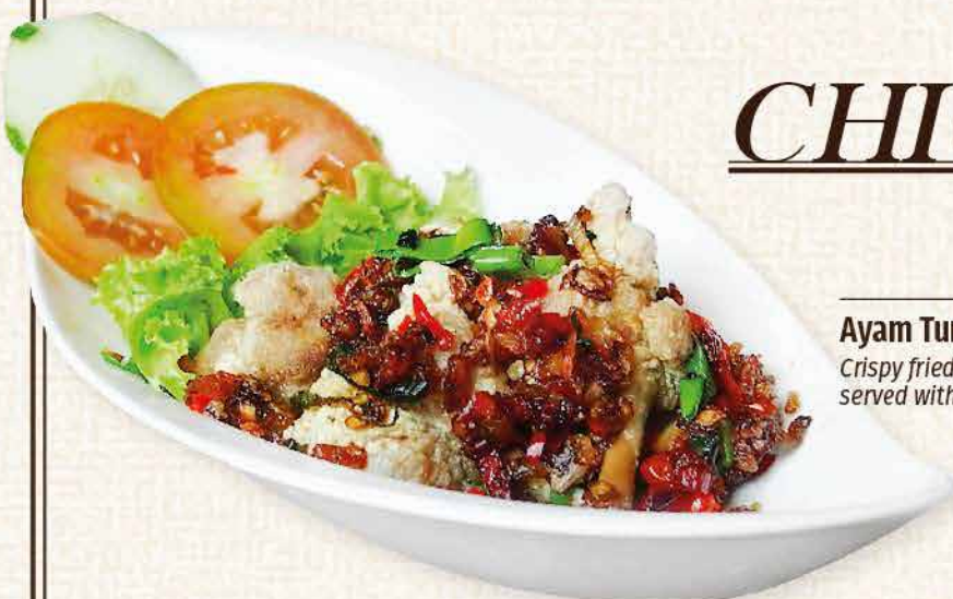
Ayam Tumis Sambal 39

Crispy fried chicken with dry stir-fried chilli, served with rice