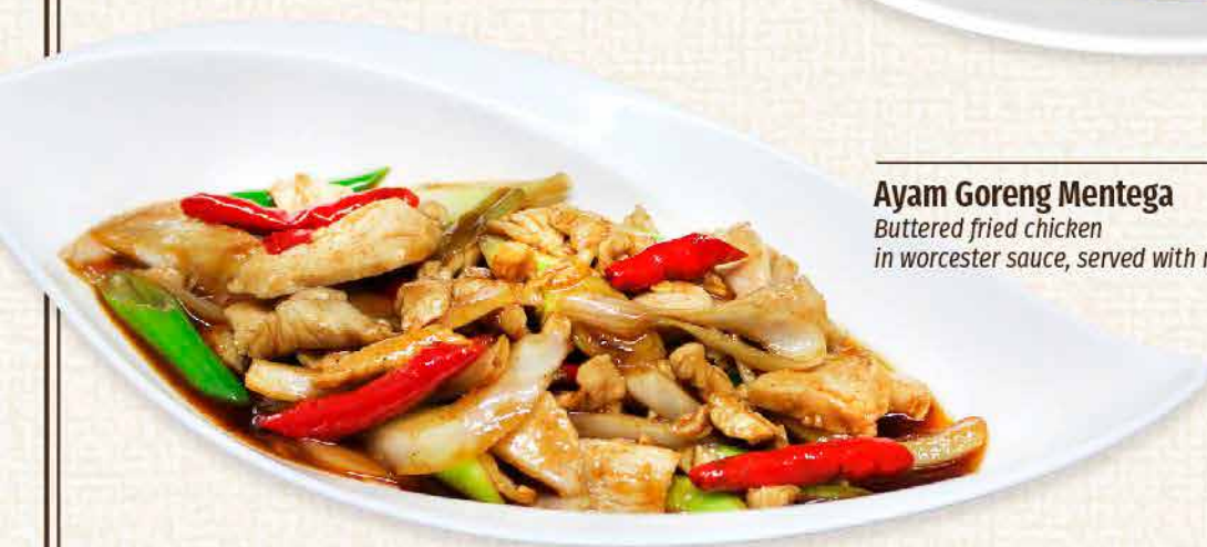
Ayam Goreng Mentega 39

Buttered fried chicken in worcester sauce, served with rice