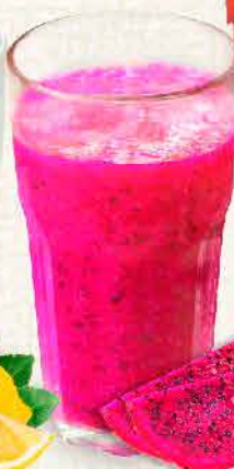
Dragon Fruit 20