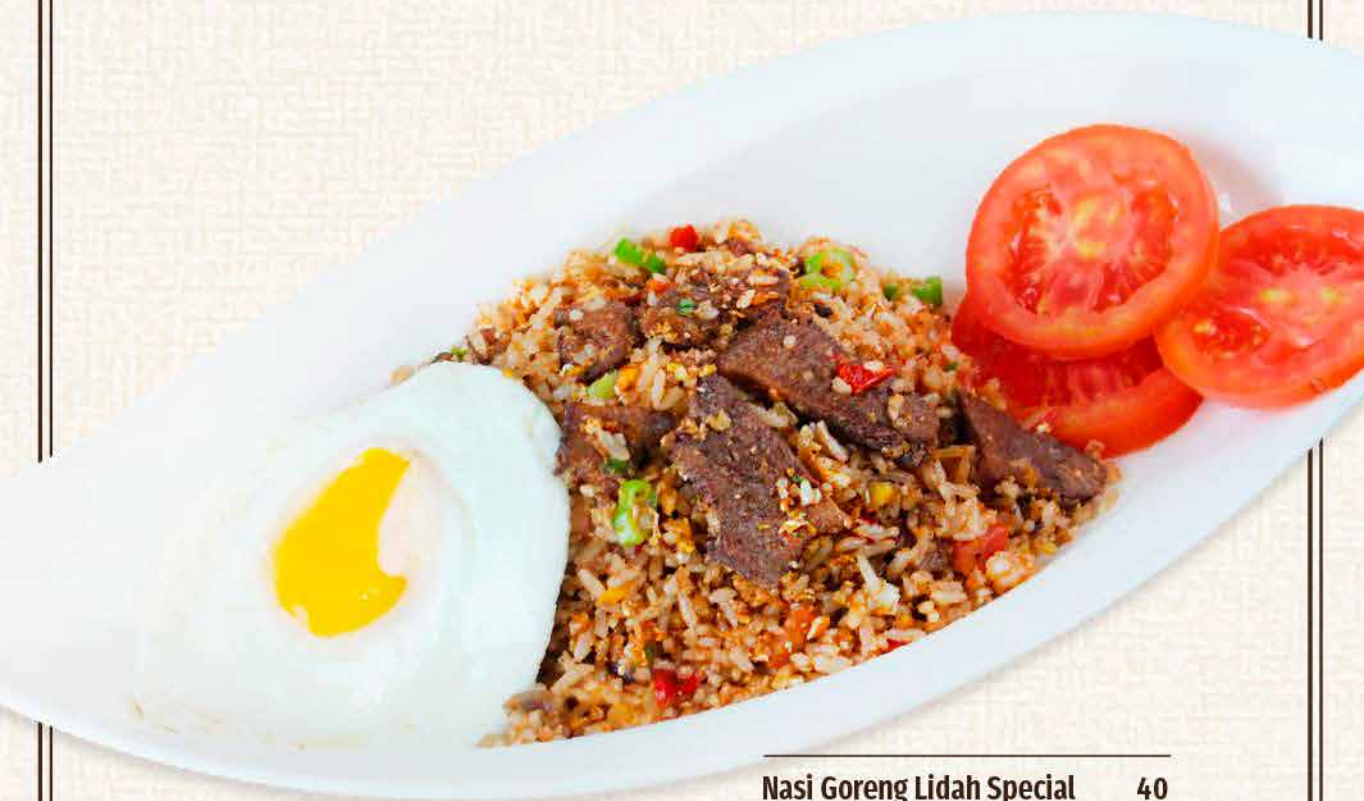
Nasi Goreng Lidah Special 40 Beef tongue fried rice with egg